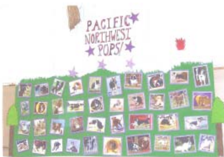
NW Competitors Brought Along Special Dog Photo Mural